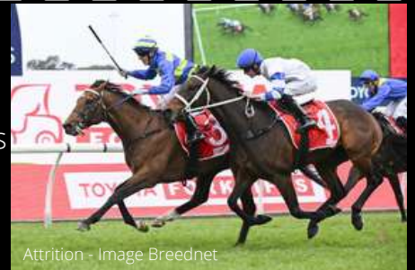
Attrition