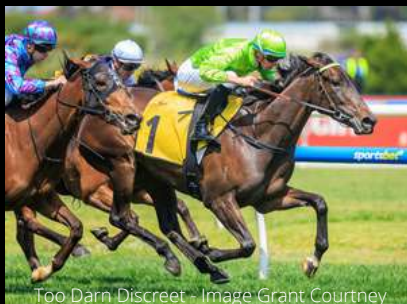
Too Darn Discreet